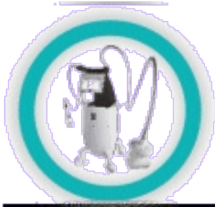
Alliance Cellu M6