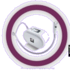
Huber 360 Evolution